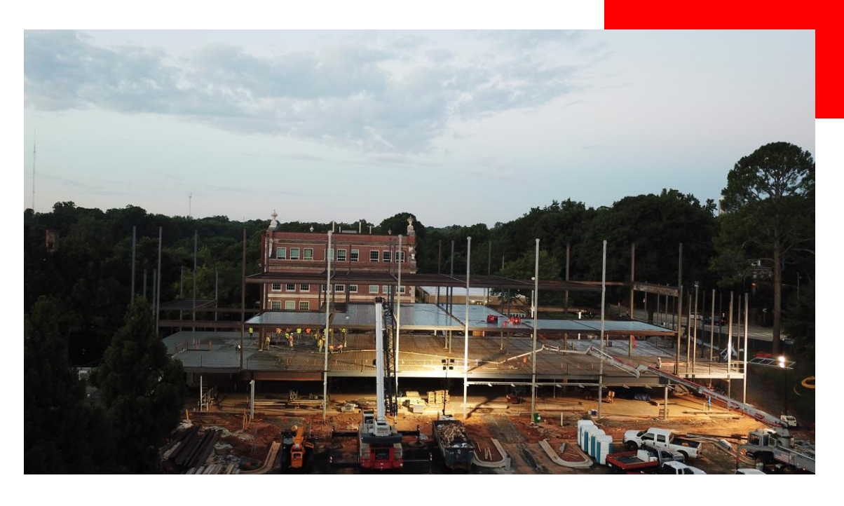
Second Floor slab pour