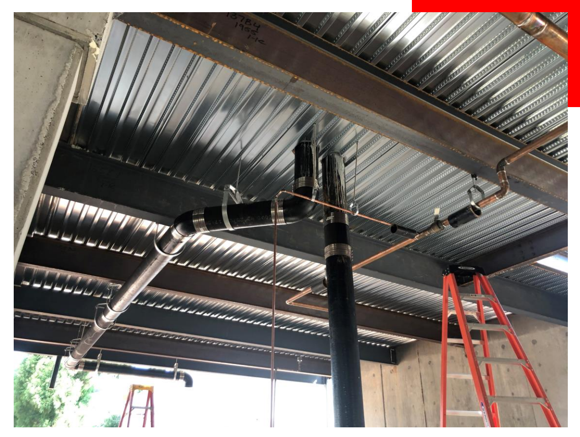
Continue installation of water and storm piping at new addition