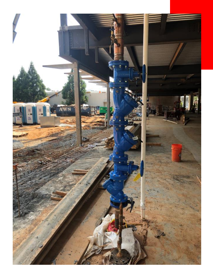
Water Riser Valves Installed