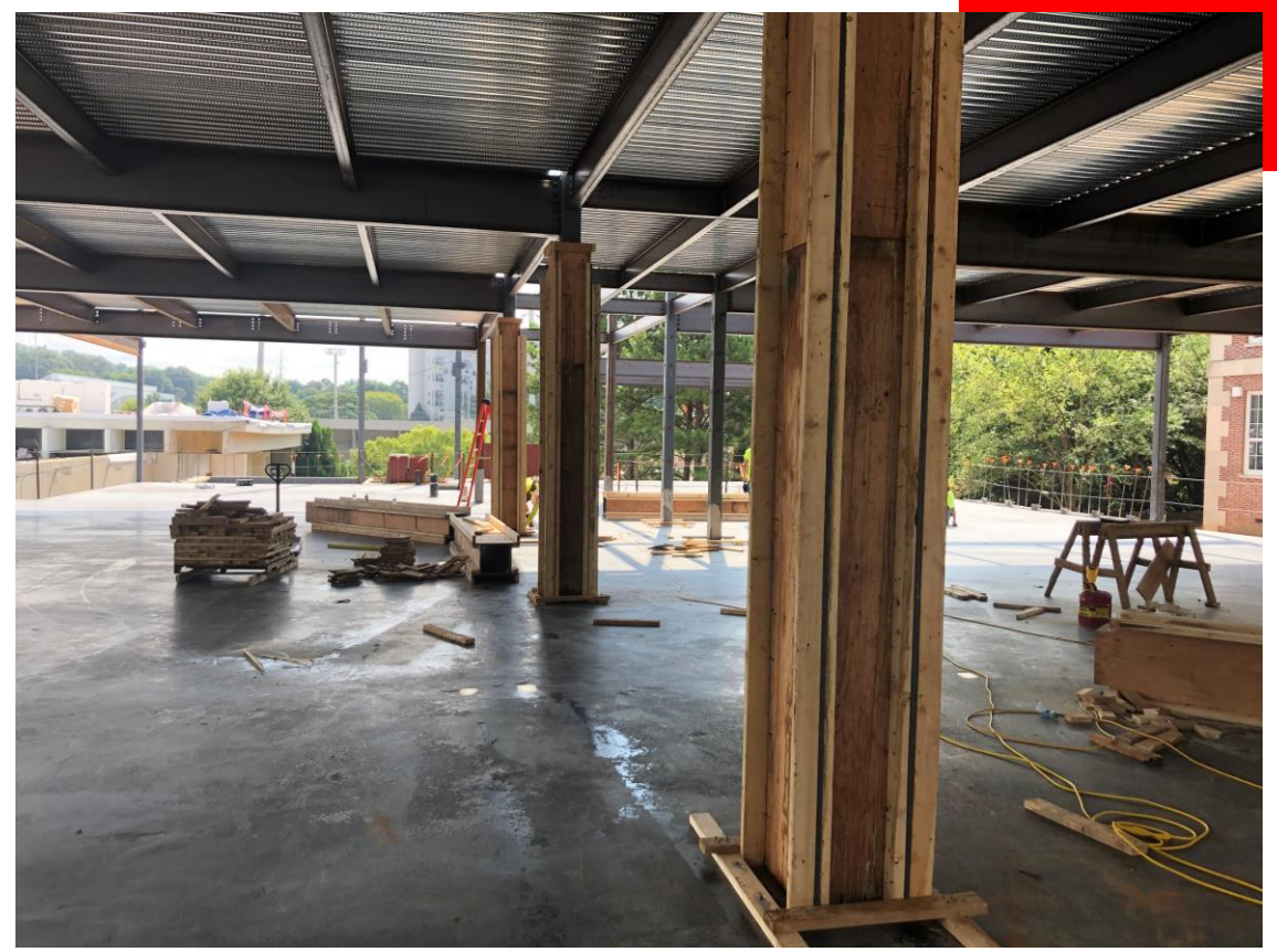
Second Floor Slab complete, Interior column wrap progress